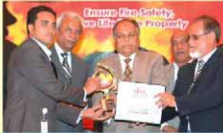
BULLEH SHAH PACKAGING PVT LTD