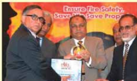
PAK ARAB REFINERY LTD