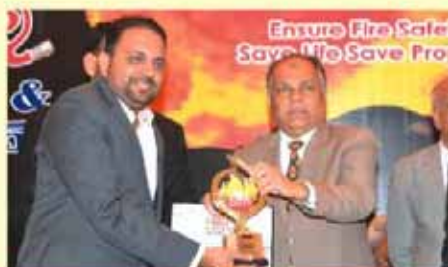
TOTAL OIL PVT LTD