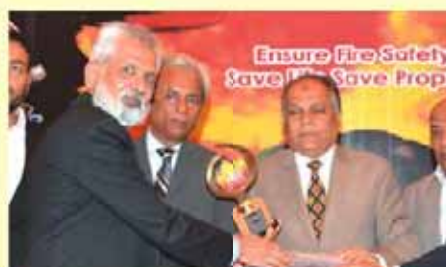
LOTTE CHEMICAL PAKISTAN LTD