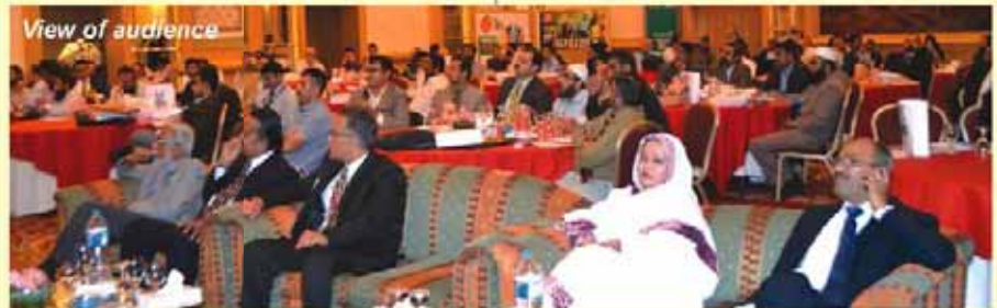
View of audience