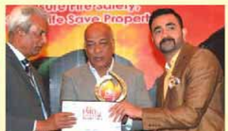
PAK OASIS PVT LTD