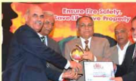
HABIB BANK LTD