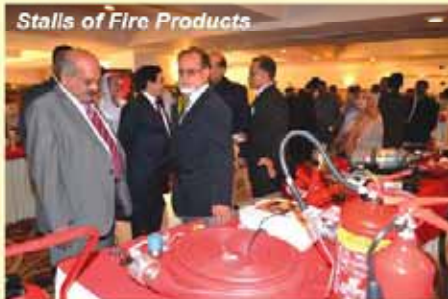
Stalls of Fire Products