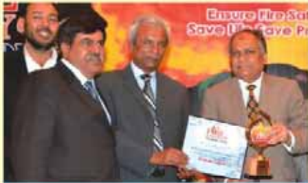
PAKISTAN INTERNATIONAL AIRLINES