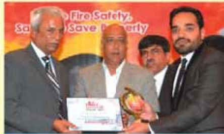
PAKISTAN OILFIELDS LTD