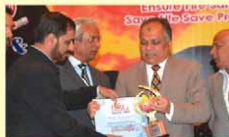
YUNUS TEXTILE MILLS LTD