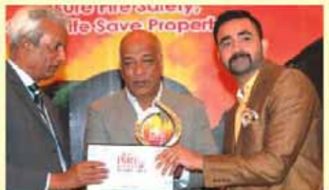
PAK OASIS PVT LTD