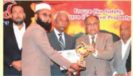
ENGRO POWERGEN QADIRPUR LTD