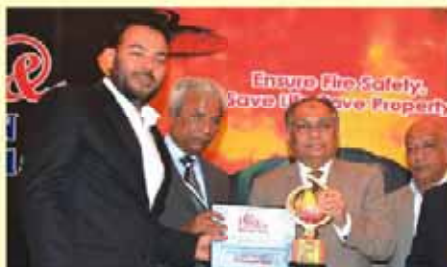
HASEEN HABIB TRADING PVT LTD