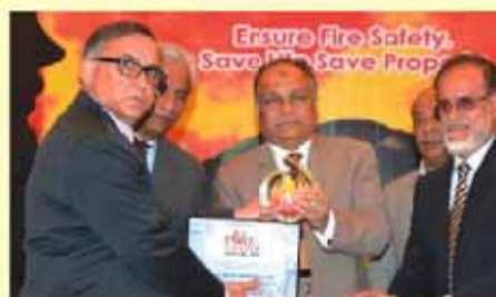
PAK ARAB REFINERY LTD