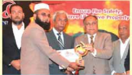
ENGRO POWERGEN QADIRPUR LTD