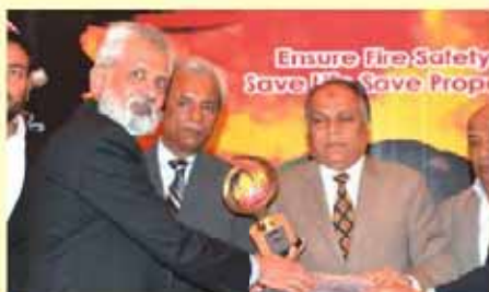
LOTTE CHEMICAL PAKISTAN LTD