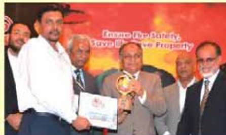
FEROZE 1888 MILLS LTD