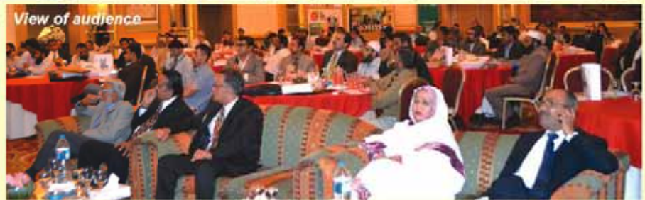
View of audience

warrants a joint action plan and strategy by all trade unions and groups like chamber of commerce. "Each shop, house or factory should have fire fighting system and be made safe from fires. Steps should be taken as an national emergency in this direction and NFEH is also striving to make buildings safe," he stressed.