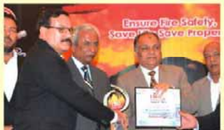
HILAL FOODS PVT LTD