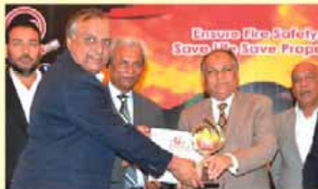
SUI SOUTHERN GAS COMPANY LTD