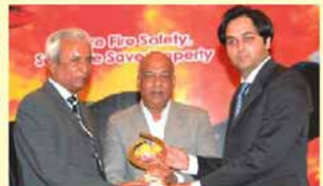
SUI NORTHERN GAS PIPELINES LTD