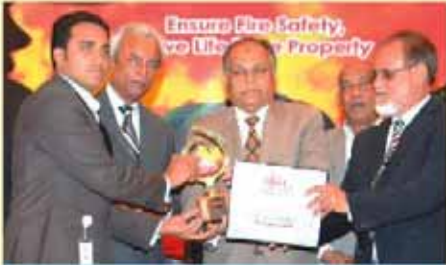
BULLEH SHAH PACKAGING PVT LTD