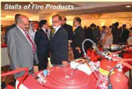
Stalls of Fire Products