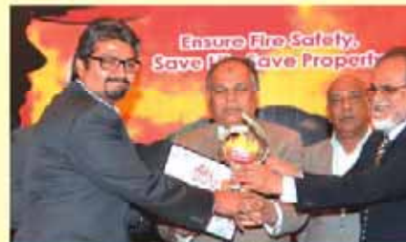
SYNGENTA PAKISTAN LTD