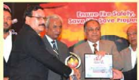
HILAL FOODS PVT LTD