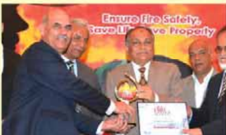
HABIB BANK LTD