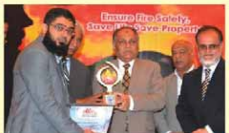
MIMA KNIT PVT LTD