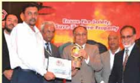
FEROZE 1888 MILLS LTD