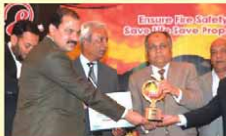
SOORTY ENTERPRISES PVT LTD