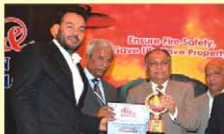
HASEEN HABIB TRADING PVT LTD