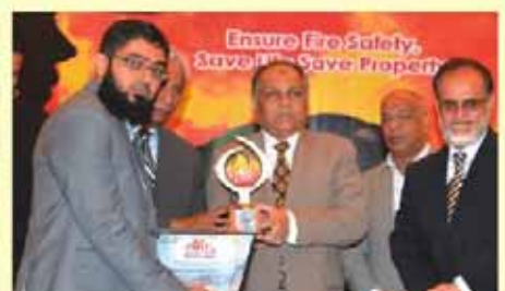
MIMA KNIT PVT LTD