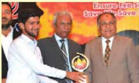
SAYLANI WELFARE TRUST