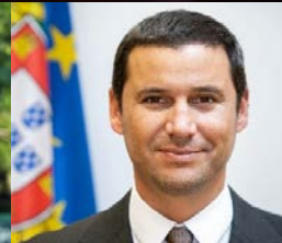
João Galamba Deputy Minister and Secretary of State for Energy MINISTRY OF ENVIRONMENT AND CLIMATE ACTION, PORTUGAL